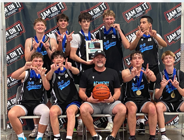
10th White wins the Las Vegas Grand Finale Championship