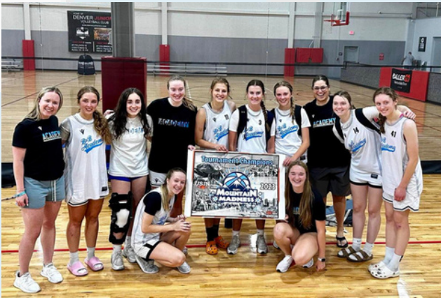
11th Black wins the Mountain Madness Championship