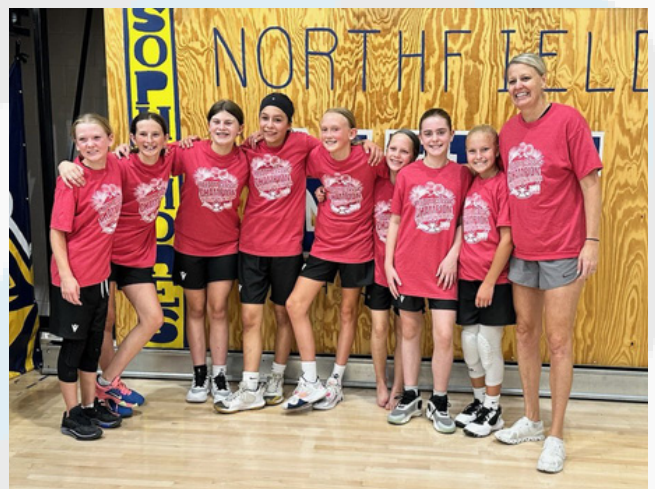
5th White wins the Freedom Classic Championship

Another successful Spring and Summer season is in the books, and we could not be more proud of how hard every team competed this year.