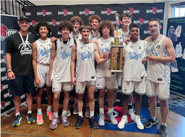
9th Black wins the Diamond Division Championship in Las Vegas